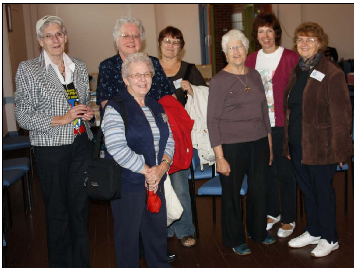
Ladies who preferred Floriade to lectures