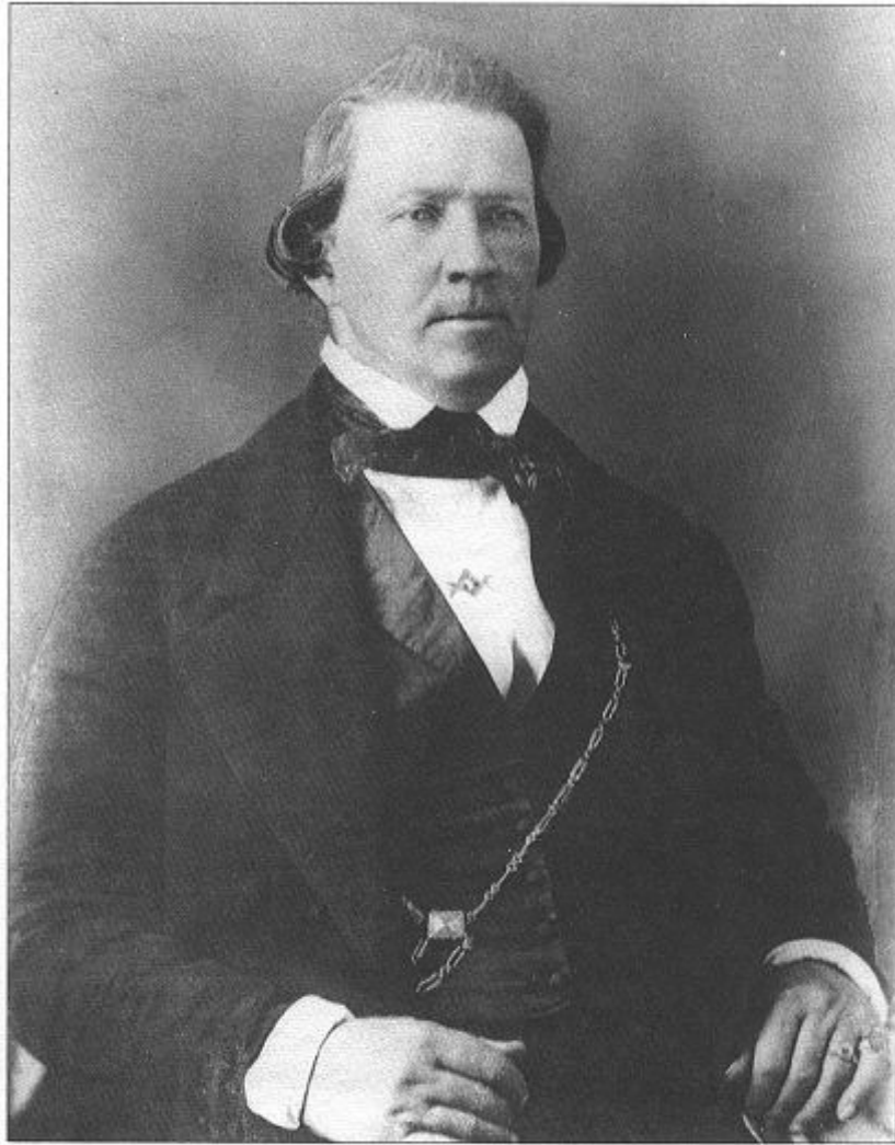
Brigham Young revised and institutionalized Joseph Smith's temple ceremonies beginning in late 1845 in Nauvoo. Note the Masonic square and compass pin on his shirt.