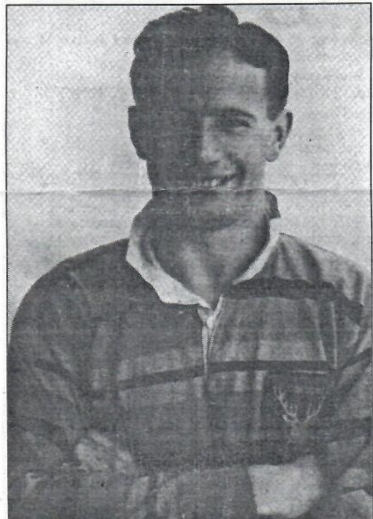
In his younger days . . . Wallaby captain Trevor Allan in 1949.

He captained the School's first XV during his final year and the team went through the Combined High Schools competition without a point being scored against them until the Grand Final when the opposing team kicked a penalty goal. After graduating from North Sydney Tech High in 1946, he was drafted into Gordon's first XV.