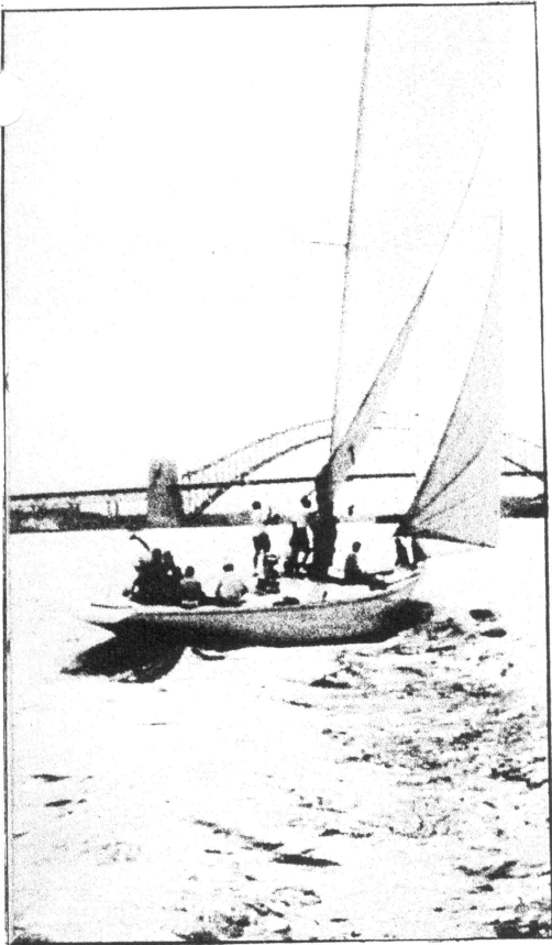
Gretel on Sydney Harbour