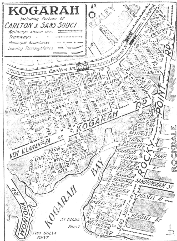
Reprinted from Wilson's Authentic Director, 1924.