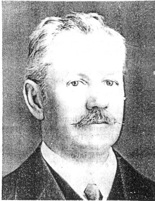
Bro. J.H. Carruthers.

In 1894, in the government led by Bro. (Sir) George Reid, Carruthers was Secretary for Lands and introduced the Land Act of 1895. It won him political acclaim which later stood him in good stead after his divorce in 1895.