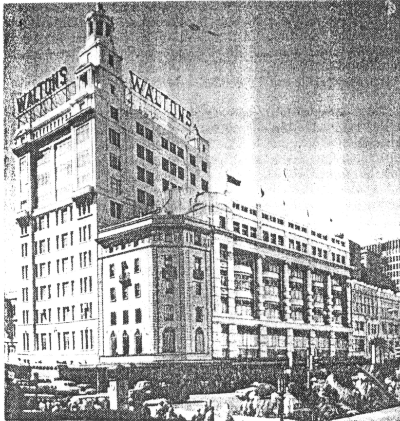
The former Murdoch's Store